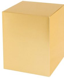
Sheet Bronze Price: $190 Brass Victoriaville US235-20001 Size: 5.6W x 5.6L x 7D