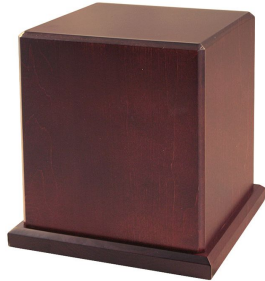
Sherwood Price: $310 Wood Victoriaville US150-00001 Size: 7.8"W x 8.4"D x 7.8"L