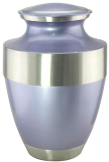
Elite Starlight Price: $300 Metal Victoriaville US430-05201 Size: 6"W x 10.25"H Also available in bronze