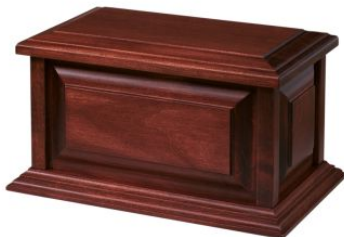
Brentwood Price: $340 Hardwood Victoriaville US210-00013 Size: 7Wx12Lx6.5D