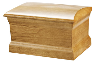
Artisan Earthtone Price: $250 Wood Victoriaville US150-00276 Size: 6"D x 10.5L x 7.5"W