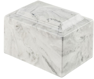
Greytone Marble Price: $300 Cultured Marble Victoriaville US335-20004 Size: 7Wx6.5Hx10L