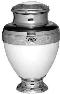
Mother of Pearl Price: $330 Metal Gravure craft UR-1734 Size: 7"D x 10"H