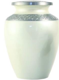
Celeste Pearl Price: $330 Alloy Dodge 941801 Size: 9.4"D x 6.9"H