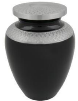
Celeste Charcoal Price: $330 Alloy Dodge 941701 Size: 9.4D x 6.9"H Also available in indigo