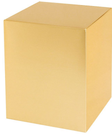
Sheet Bronze Price: $190 Brass Victoriaville US235-20001 Size: 5.6W x 5.6L x 7D