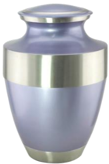
Elite Starlight Price: $300 Metal Victoriaville US430-05201 Size: 6"W x 10.25"H Also available in bronze