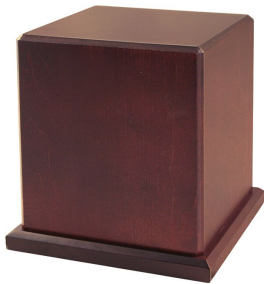
Sherwood Price: $310 Wood Victoriaville US150-00001 Size: 7.8"W x 8.4"D x 7.8"L