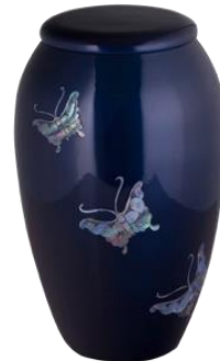
Purple Pearl Butterfly Price: $410 Aluminum Gravure craft UR-7100 Size: 6"D x 10.75"H