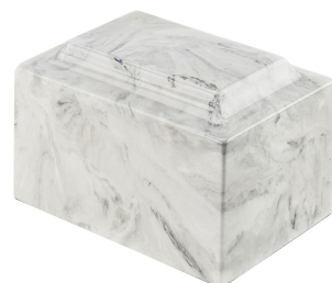
Greytone Marble Price: $300 Cultured Marble Victoriaville US335-20004 Size: 7Wx6.5Hx10L