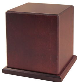
Sherwood Price: $310 Wood Victoriaville US150-00001 Size: 7.8"W x 8.4"D x 7.8"L