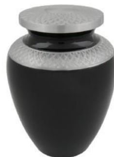
Celeste Charcoal Price: $330 Alloy Dodge 941701 Size: 9.4D x 6.9"H Also available in indigo