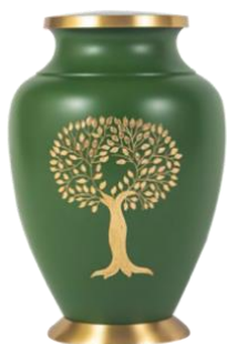
Tree of Life Price: $335 Brass Gravure craft UR-3101 Size: 6.25"D x 9.75"H