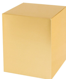
Sheet Bronze Price: $190 Brass Victoriaville US235-20001 Size: 5.6W x 5.6L x 7D