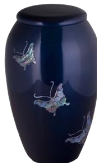
Purple Pearl Butterfly Price: $410 Aluminum Gravure craft UR-7100 Size: 6"D x 10.75"H