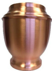
Sentinel Copper Price: $240 Copper Gravure craft UR- 1403C Size: 6.5"D x 8"H Also available in gold and pewter