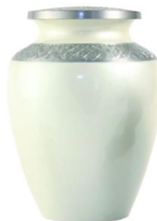
Celeste Pearl Price: $330 Alloy Dodge 941801 Size: 9.4"D x 6.9"H