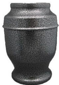
Thamesford Pewter Price: $170 Spun Aluminum Gravure craft UR-2009 Size: 8"H x 6"D Also available in copper and gold

(Please, note a wider selection of urns are available on our website and upon request)