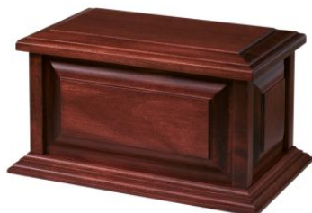
Brentwood Price: $340 Hardwood Victoriaville US210-00013 Size: 7Wx12Lx6.5D