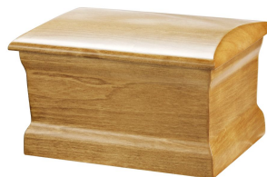
Artisan Earthtone Price: $250 Wood Victoriaville US150-00276 Size: 6"D x 10.5L x 7.5"W