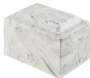
Greytone Marble Price: $300 Cultured Marble Victoriaville US335-20004 Size: 7Wx6.5Hx10L