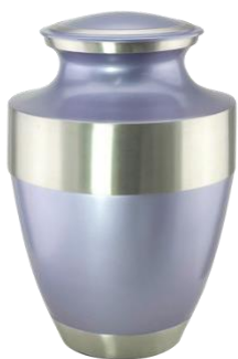
Elite Starlight Price: $300 Metal Victoriaville US430-05201 Size: 6"W x 10.25"H Also available in bronze