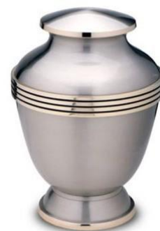
Elegant Pewter Price: $460 Brass Dodge 960251 Size: 12"H x 7.25"D Also available in copper, gold, sapphire and floral