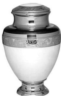
Mother of Pearl Price: $330 Metal Gravure craft UR-1734 Size: 7"D x 10"H