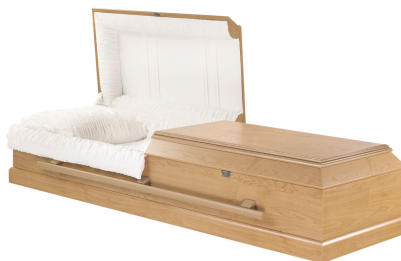
Alder Price: $1150 Victoriaville PV272-00005 Exterior: Woodgrain Interior: Beige Crepe Dimensions: 81.7L-29W-19.7H