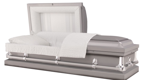
Bailey Silver Price: $1325 Victoriaville MR260-00110 Exterior Material: 20 gauge Steel, Silver Colour Interior Material: Silver Crepe Dimensions: 83.8L-28.8W-23H Also available in white