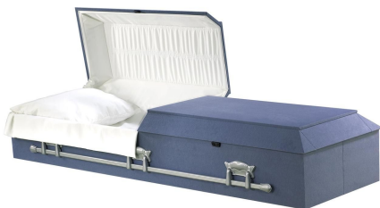
Toledo Price: $900 Victoriaville DR220-00040 Exterior: Blue Cloth Interior: White Silk Dimensions: 79.5L-25W-16.5H