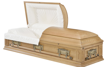
Testament Price: $3100 Victoriaville WR212-00055-CC Exterior: Solid Oak and Veneer, Flax Colour, Satin Finish Interior: Tan Crepe Dimensions: 22.5"H x 82.4"L x 28.3"W