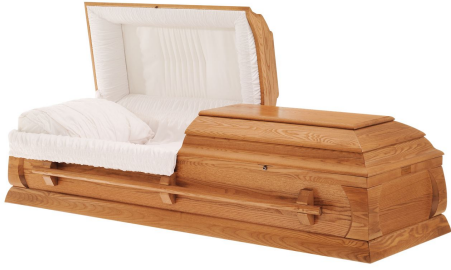
Ashton Price: $1945 Victoriaville WR232-00418-CC Exterior: Ash and Veneer, Fawn Colour, Satin Finish Interior: Beige Crepe Dimensions: 82.2L-28.4W-20.5H Cremation or Burial