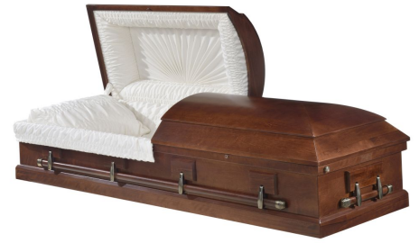
Winfield Price: $2510 Victoriaville W252-00052-CC Exterior: Solid Poplar & Veneer, American Cherrywood Colour, Satin Finish Interior: Tan Crepe Dimensions: 82L-22.5W-27.9H Cremation or Burial