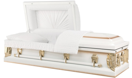
Monarch White Price: $2950 Victoriaville WR260-00099 Exterior: 20 gauge Steel, White Colour Interior: White Crepe Dimensions: 83.5L-28.6W-23H Burial Only