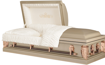
Monarch Sandstone Price: $2950 Victoriaville WR260-00082 Exterior: 20 gauge Steel, Sandstone Colour, Metallic Finish Interior: Tan Crepe Dimensions: 83.5L-28.6W-23H Burial Only