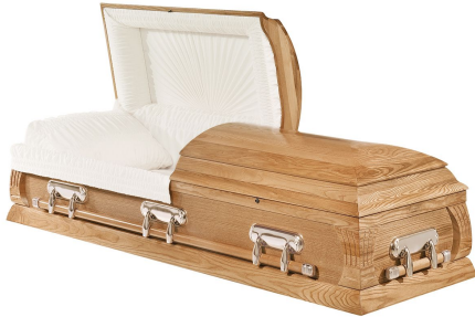
Digby Price: $2600 Victoriaville WR232-00429-CC Exterior: Solid Ash and Veneer, Saffron Colour, Gloss Finish Interior: Crepe Dimensions: 82.2L-26.7W-20.5H Cremation or Burial