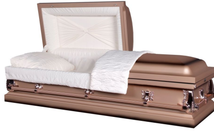
Payne Copper Price: $2300 Victoriaville MR260-00056 Exterior: 20 gauge Steel, Copper Gasketed Colour/Finish Interior: Tan Crepe Dimensions: 83.8L-28.8W-23H Burial Only