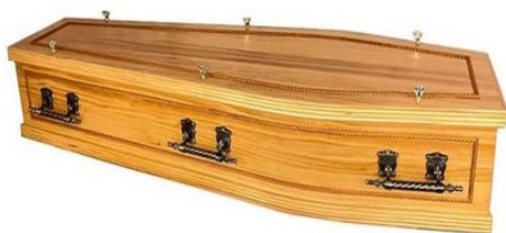
Goldfinch Nest Price: $2300 GC Coffins Model: N10-1 Exterior: Solid Pine, Light Stain Interior: Natural Biodegradable Cotton Dimensions: 13"H x 80"L x 26"W