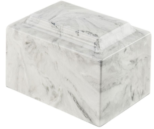
Greytone Marble Price: $300 Cultured Marble Victoriaville US335-20004 Size: 7Wx6.5Hx10L