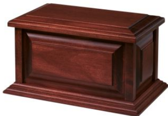
Brentwood Price: $340 Hardwood Victoriaville US210-00013 Size: 7Wx12Lx6.5D