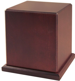
Sherwood Price: $310 Wood Victoriaville US150-00001 Size: 7.8"W x 8.4"D x 7.8"L