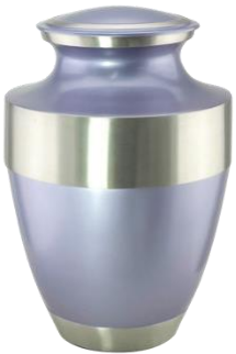
Elite Starlight Price: $300 Metal Victoriaville US430-05201 Size: 6"W x 10.25"H Also available in bronze