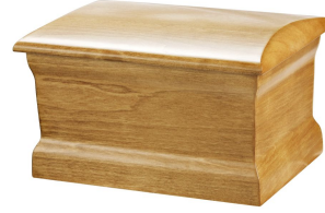
Artisan Earthtone Price: $250 Wood Victoriaville US150-00276 Size: 6"D x 10.5L x 7.5"W