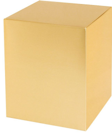
Sheet Bronze Price: $190 Brass Victoriaville US235-20001 Size: 5.6W x 5.6L x 7D