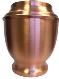
Sentinel Copper Price: $240 Copper Gravure craft UR- 1403C Size: 6.5"D x 8"H Also available in gold and pewter