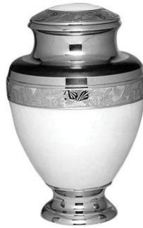
Mother of Pearl Price: $330 Metal Gravure craft UR-1734 Size: 7"D x 10"H