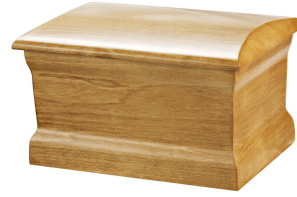
Artisan Earthtone Price: $250 Wood Victoriaville US150-00276 Size: 6"D x 10.5L x 7.5"W