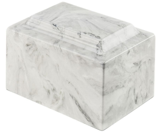
Greytone Marble Price: $300 Cultured Marble Victoriaville US335-20004 Size: 7Wx6.5Hx10L