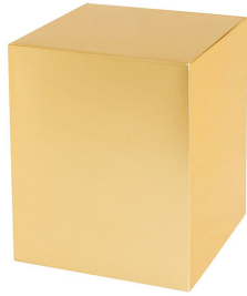
Sheet Bronze Price: $190 Brass Victoriaville US235-20001 Size: 5.6W x 5.6L x 7D