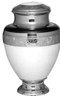
Mother of Pearl Price: $330 Metal Gravure craft UR-1734 Size: 7"D x 10"H