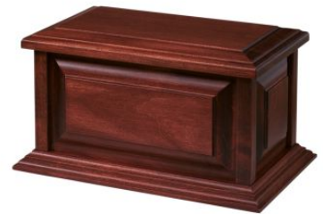
Brentwood Price: $385 Hardwood Victoriaville US210-00013 Size: 7Wx12Lx6.5D