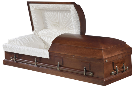
Winfield Price: $2760 Victoriaville W252-00052-CC Exterior: Solid Poplar and Veneer, American Cherrywood Colour, Satin Finish Interior: Tan Crepe Dimensions: 82L-22.5W-27.9H"