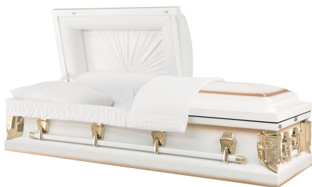
Monarch White Price: $3610 Victoriaville WR260-00099 Exterior: 20 gauge Steel, White Colour Interior: White Crepe Dimensions: 83.5L-28.6W-23H