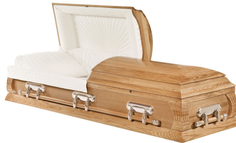
Digby Price: $3145 Victoriaville WR232-00429-CC Exterior: Solid Ash and Veneer, Saffron Colour, Gloss Finish Interior: Crepe Dimensions: 82.2L-26.7W-20.5H