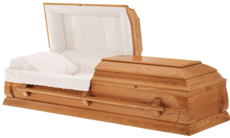
Ashton Price: $2800 Victoriaville WR232-00418-CC Exterior: Ash and Veneer, Fawn Colour, Satin Finish Interior: Beige Crepe Dimensions: 82.2L-28.4W-20.5H