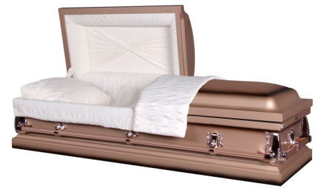
Payne Copper Price: $2700 Victoriaville MR260-00056 Exterior: 20 gauge Steel, Copper Colour Finish Interior: Tan Crepe Dimensions: 83.8L-28.8W-23H"