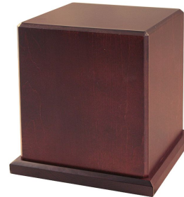
Sherwood Price: $365 Wood Victoriaville US150-00001 Size: 7.8"W x 8.4"D x 7.8"L