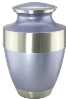
Elite Starlight Price: $355 Metal Victoriaville US430-05201 Size: 6"W x 10.25"H Also available in bronze