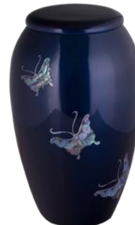
Purple Pearl Butterfly Price: $440 Aluminum Gravure craft UR-7100 Size: 6"D x 10.75"H