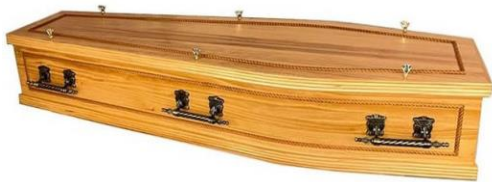
Goldfinch Nest Price: $2990 GC Coffins Model: N10-1 Exterior: Solid Pine, Light Stain Interior: Natural Biodegradable Cotton Dimensions: 13"H x 80"L x 26"W