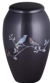
Grey Song Birds Price: $440 Aluminum Gravure craft UR-7124 Size: 6"W x 10"H Also available in purple