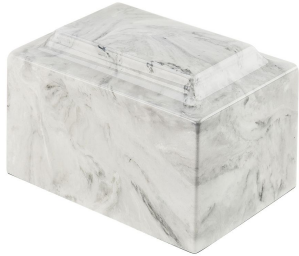
Greytone Marble Price: $350 Cultured Marble Victoriaville US335-20004 Size: 7Wx6.5Hx10L