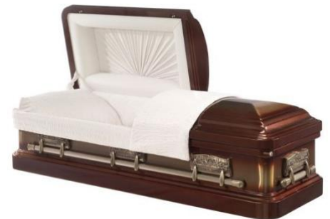
Cognac Jewel Price: $5600 Victoriaville MR250-00098 Exterior: Steel 18 ga., Brown Finish Interior: Beige Velvet Dimensions: 23"H x 83.5"L x 29"W