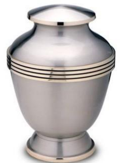
Elegant Pewter Price: $520 Brass Dodge 960251 Size: 12"H x 7.25"D Also available in copper, gold, sapphire and floral