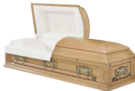
Testament Price: $4855 Victoriaville WR212-00055-CC Exterior: Solid Oak and Veneer, Flax Colour, Satin Finish Interior: Tan Crepe Dimensions: 22.5"H x 82.4"L x 28.3"W