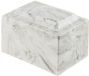
Greytone Marble Price: $350 Cultured Marble Victoriaville US335-20004 Size: 7Wx6.5Hx10L