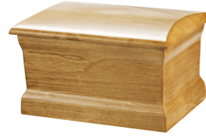
Artisan Earthtone Price: $295 Wood Victoriaville US150-00276 Size: 6"D x 10.5L x 7.5"W