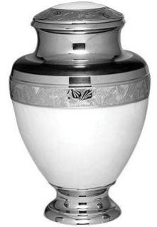
Mother of Pearl Price: $345 Metal Gravure craft UR-1734 Size: 7"D x 10"H