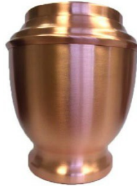
Sentinel Copper Price: $250 Copper Gravure craft UR- 1403C Size: 6.5"D x 8"H Also available in gold and pewter