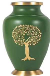
Tree of Life Price: $355 Brass Gravure craft UR-3101 Size: 6.25"D x 9.75"H